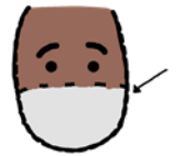
covers mouth and nose

Some people do not need to wear masks or face coverings such as those